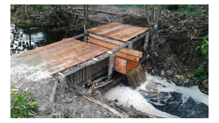
Figure 16. Canal Blockage for Rewetting Peatland

By the end of 2016, peat restoration priorities of 2,492,527 hectares have been mapped. Another achievement is social intervention through community support in 104 villages in four priority districts of 806,312 hectares. Social intervention is crucial in order for a community consultation process and consensus agreements where canals and a drill canal will be built. Thirty six concession holders have been assigned, spreading in South Sumatra, Central Kalimantan, West Kalimantan, Riau and Jambi Provinces for peat restoration on 650,389 hectares or 26% of the area of peat restoration. In the restoration, concession holders also obtained technical guidance including water level and humidity monitoring techniques.