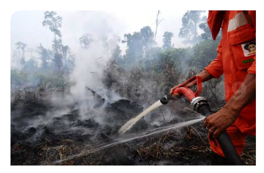
Figure 13. Fire-fighting by Manggala Agni, MoEF, 2015