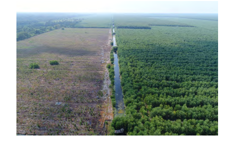
Figure 11. Canal Blocking Perimeter of a private company in Riau Province

The role of private sectors in balancing economic and ecological aspects of peatland management is important. As they manage the peatland based on regulations and technical guides provided by the government, their compliances to the regulations will ensure the sustainability of Indonesian peatlands. Some of the peatland has been utilised for commercial purposes by 100 concessionaires, including 99 concessions for industrial plantation forest and 1 concession for logging natural production forest concession. In 1990s the number of concessionaires were only 12, in 2000s the number increased significantly to become 73. Since 2010, the number of concessionaires have increased by 17 to become 100 concessionaires in total.