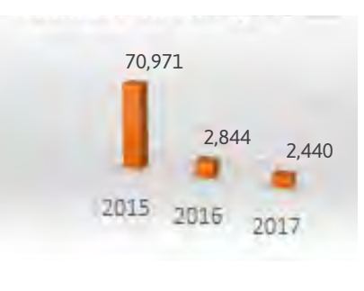
Figure 5. Number of Hotspots from 2015 to 2017

The success to reduce the number of hotspots and the area burnt during the last three years has led to the reduction of emissions from forests and lands, including from peatlands. Emissions from peat fires in 2017 was about 12,5 million tons CO2e or only 1.56% of emissions from peat fires in 2015 that reached 803 million tons CO2e. This is a big achievement that need to be maintained and institutionalized at all level of governments, from central to provincial and district until village governments.