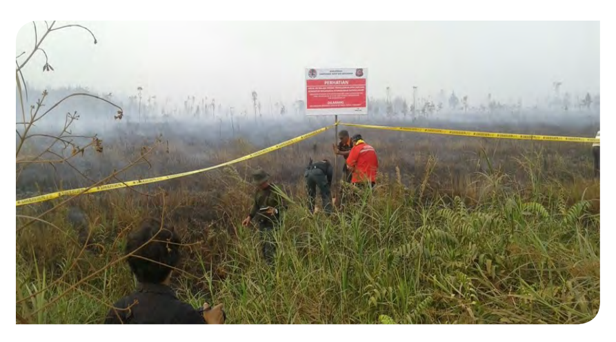
Figure 6. Police lines by MoEF investigators, 2015

Policies and regulations developed for governing Indonesian peatland have also been supported by law enforcement implemented by the Ministry of Environment and Forestry and other law enforcement bodies. After big land and forest fires in 2015, about 500 cases have already been brought to justice and some of them have received sanctions, including a historic USD 1.2 billion fine to a private corporation proven to have committed crimes against the environment. This law enforcement does not only prevent others to do similar crimes, but also improves public trust in environmental law enforcement in Indonesia.