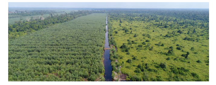
Figure 10. Canal Blocking Perimeter of a private company in Riau Province

The role of private sectors in balancing economic and ecological aspects of peatland management is important. As they manage the peatland based on regulations and technical guides provided by the government, their compliances to the regulations will ensure the sustainability of Indonesian peatlands. Some of the peatland has been utilised for commercial purposes by 100 concessionaires, including 99 concessions for industrial plantation forest and 1 concession for logging natural production forest concession. In 1990s the number of concessionaires were only 12, in 2000s the number increased significantly to become 73. Since 2010, the number of concessionaires have increased by 17 to become 100 concessionaires in total.