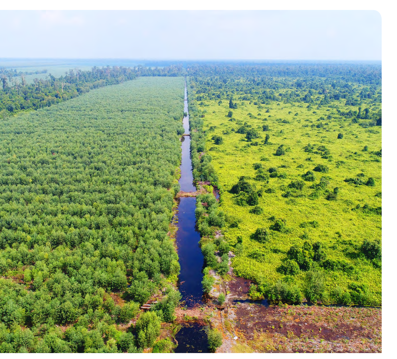
Figure 1. Pristine Peatland of Indonesia, Giam Siak Biosphere Reserve, Riau Province (2017)